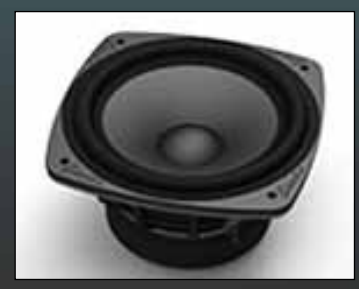
5.25" HIGH-DEFINITION BASS/MIDRANGE DRIVER (XXL)