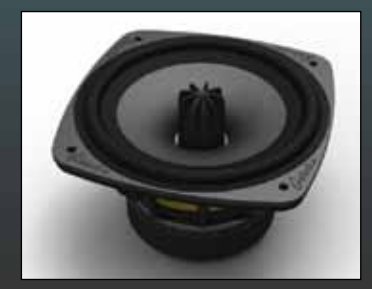
5.25" HIGH-DEFINITION BASS/MIDRANGE DRIVER