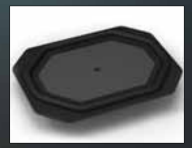
QUADRATIC PLANAR INFRASONIC RADIATOR